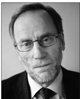
Claes Stråth National Mediation Office