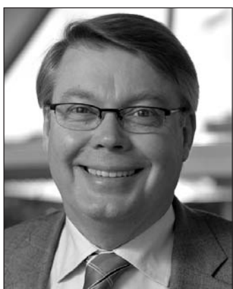
Bo Lundgren Swedish National Debt Office